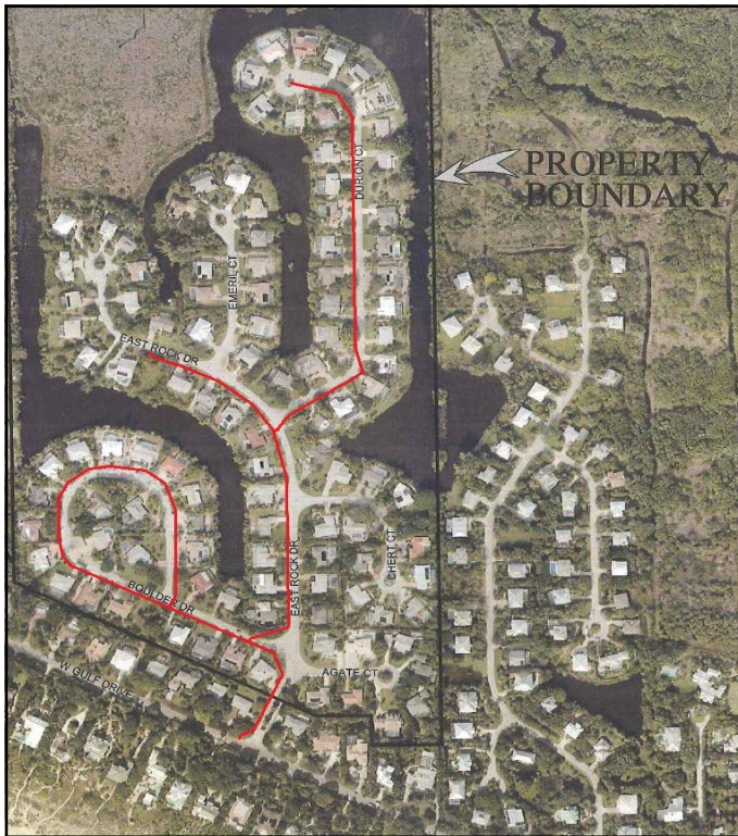
East Rocks Subdivision

likely in May, and last through the summer. All affected homeowners will be notified well in advance of commencement. All affected areas of construction will be restored as close as is possible to original condition. This project continues IWA's ongoing plan to replace as much of the aging thin-walled pipe in our system as is possible and practical.