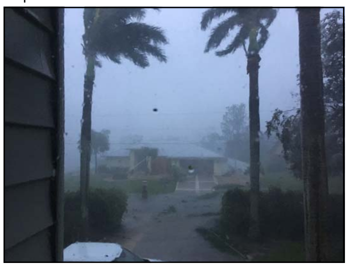
Hurricane Irma in Fort Myers

Island Water has some water tips for our members in preparation for a storm and what can be expected after the storm.