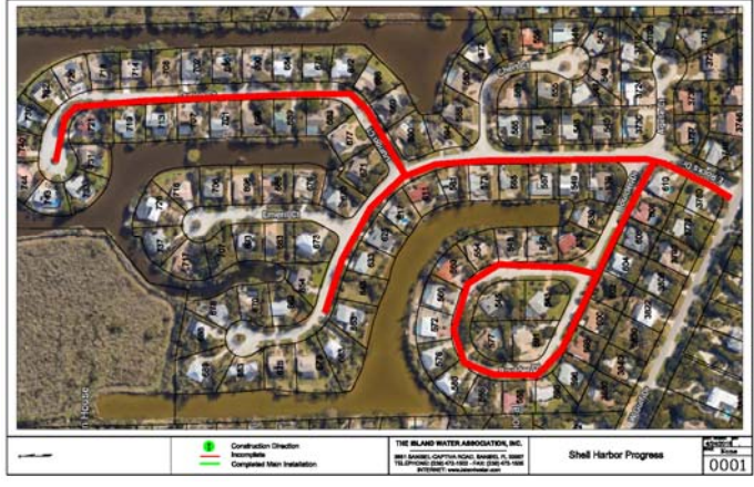
Map of East Rocks Subdivision Piping Replacement

He also talked about major capital projects planned for 2018, including replacement of our Brine Pumping Station, rehabilitation of Hawthorn Well 14 to increase pumping capacity, and the replacement of aging thin-walled water pipe in the East Rocks Subdivision.