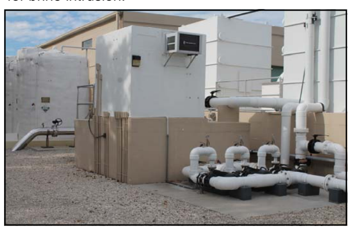
Current Brine Clearwell with Three Centrifugal Pumps sitting at Ground Level

Brine is the leftover high mineral concentrate created by the RO process. It comprises about 20% of the raw water coming in from the well field, which means we recover about 80% of the raw water as nearly distilled potable water. The brine is pumped down our Deep Injection Well, which we share with the City for disposal of their excess reclaimed water. The disposal area is a boulder zone about 3,200 feet deep. Since we pump our drinking water from about 700 feet deep, there are a few confining layers of clay between the brine injection zone and our drinking water aquifer. We also have monitor wells at about 1500 feet that we monitor for brine intrusion.