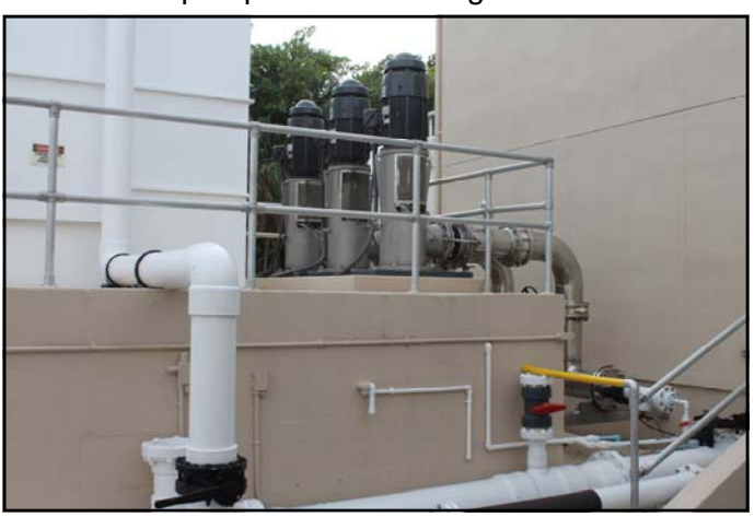
Current Product Clearwell, with Three Vertical Turbine Pumps and Motors Installed, as the New Brine Clearwell will have

Our present brine clearwell is nearing it's maximum capacity, and the three pumps and motors are below flood level, forcing us to keep three 30 HP spare pumps and motors in stock. The new clearwell will have increased capacity and use vertical turbine pumps, the motors of which will sit on top of the tank, well above flood level. It is the same system we use for our untreated fresh water (permeate) before it is transferred (pumped) to our storage tanks. The permeate clearwell is used to add disinfectant and a corrosion inhibitor before the water is pumped to the storage tanks.