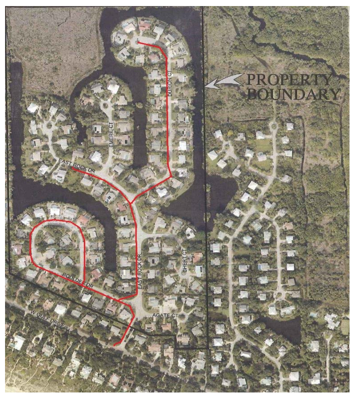
East Rocks Subdivision

Court. As with the Brine Sump Replacement project, this project will be paid for out of our reserves, with no assessments to members. This project has a budget of $280K.