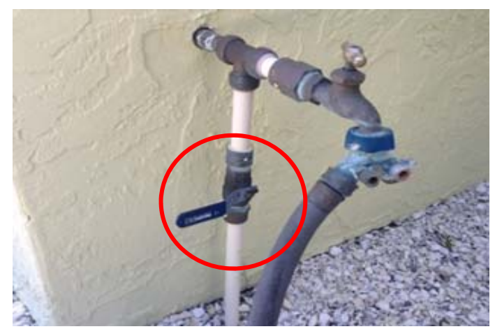
A Quarter Turn Single Lever Ball Valve in the Off Position

turn levers. If the lever is horizontal, the water to the house is off. If the lever is vertically lined up with the pipe, the house valve is on. Most times the house valve turns off the water to the inside of your residence as well as the outside spigots on the house. It usually does not turn off your irrigation system.