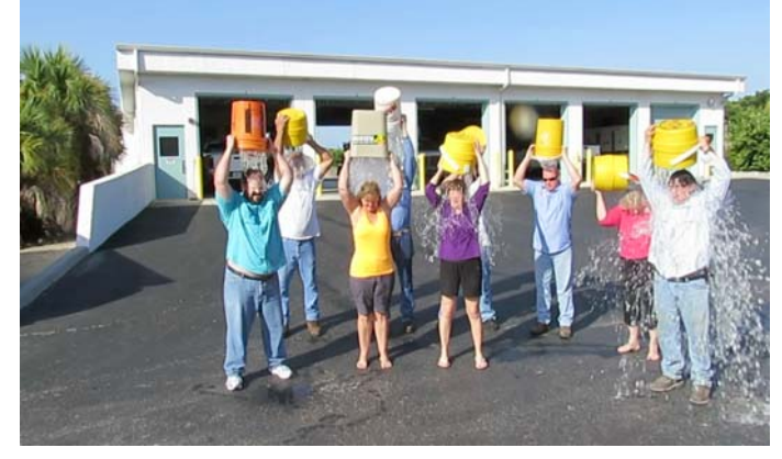
IWA Employees Taking The Ice Bucket Challenge

search" (Wikipedia). After a person or organization performs the challenge, they nominate another individual or organization to do the same. In August, IWA was nominated by the Sanibel Police Department to participate in the challenge. On August 21, nine IWA employees stepped up to the challenge,