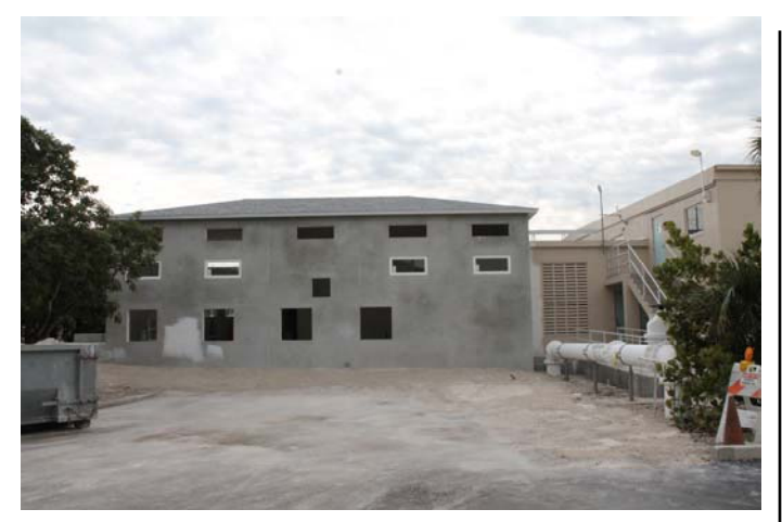
Northern View of Distribution Pump Station Addition

steady at about $7.1M, with O&M and Capital expenses estimated close to $7.0M, as one would expect from a not-for-profit organization.