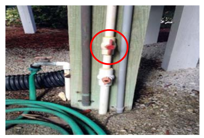
A Quarter Turn PVC Ball Valve in the On Position

turn levers. If the lever is horizontal, the water to the house is off. If the lever is vertically lined up with the pipe, the house valve is on. Most times the house valve turns off the water to the inside of your residence as well as the outside spigots on the house. It usually does not turn off your irrigation system.