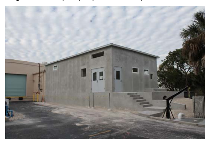
Southern View of Distribution Pump Station Addition

Capital expenditures for 2014 included construction of an addition to the RO Plant to house our upgraded High Service Pumping Station. The High Service pumps provide the pressure to our