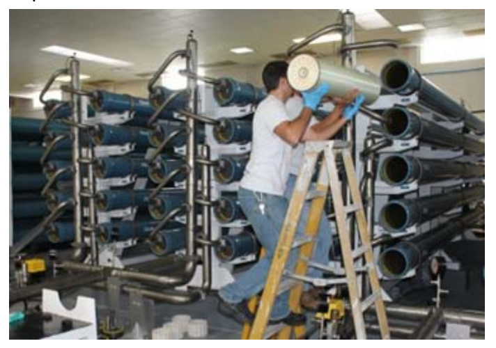
Membrane element being installed in a train vessel

The membranes are wrapped around a 1-inch tube and are packaged in an "element" that is 8 inches in diameter and 4 feet long. There are 440 square feet of membrane in each element. 6 ele-