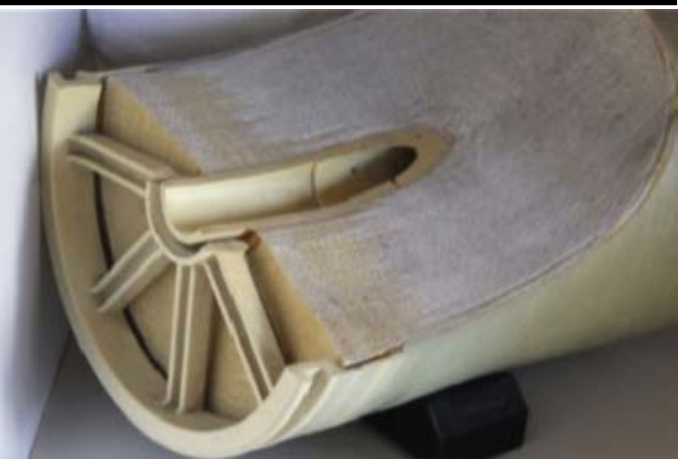
Cutaway of RO element showing spiral wound membranes

As our members are probably aware, IWA uses a process called "Reverse Osmosis" to purify the salty well water we pump from our production wells. It has been a few years since we've talked about the process in this newsletter, and we just happen to have completed the replacement of membranes in four of six trains in our plant, so it is time for a short primer on the reverse osmosis process. Our process uses a series of membranes to remove impurities from the well water. The best definition we could find for membrane comes from the Free Online Dictionary: