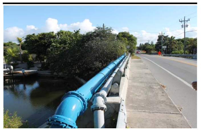
8" Ductile Iron pipe across the East Periwinkle Way bridge

IWA has numerous pipes attached to bridges and box culverts that cross various waterways around the island. The biggest and longest one of these of course is the 12-inch main that is attached to the Blind Pass Bridge. All of these exposed pipes are ductile iron, so IWA periodically inspects these pipes to ensure rust and corrosion does not become a problem. When they look like they need it, we will chip off any rust, corrosion, and old paint and apply a fresh coat of two-part epoxy based coating. We always use a primer coat first, which assures us that it will be a good long time before we need to coat the pipe again. IWA's Distribution crew just finished recoating the 8-inch pipe that runs across the East Periwinkle Way bridge.