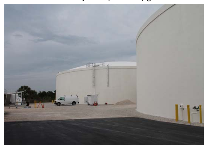
Newly cleaned and painted 5MG Storage Tanks

Included in the budgeting process is an estimate of 2013 Capital projects costs. Capital spending involves projects that maintain or upgrade IWA's infrastructure. Past examples of Capital spending include the recently completed upgrade of The