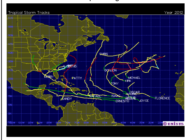
This years hurricane season was another non-event for Southwest Florida.

busy one for the Atlantic and Caribbean, with nine-teen named storms, including ten hurricanes. North Florida had to deal with Tropical Storms Beryl and Debby early in the season, with Debby's threat prompting us to put up our storm shutters for the first time in three years. Unfortunately, the Atlantic Seaboard north of Washington, D.C. was dealt a tremendous blow by Hurricane Sandy on October 29<sup>th</sup>. Damages are estimated to top $50B. To add insult to injury, a nor'easter carrying rain and snow pounded the same area a week later. Thankfully, Southwest Florida was spared again.