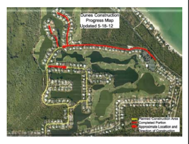
Map of construction progress in the Dunes

The Dunes Mains Replacement Project got under way in mid-April, starting near the clubhouse and working west. Locating existing utilities took longer than expected. If a definite location of a particular utility cannot be established before digging, the utility must be "pot-holed" or hand dug and exposed for a positive ID. While work is progressing on Sandcastle Rd. a second crew is installing pipe on side streets. As of this printing, pipe laying is complete on Causey Court, Sanderling Circle, and on Sandcastle from the tennis courts to Sanderling Circle. You may also notice a "boring" machine, a funny looking tractor with a rack full of metal pipes