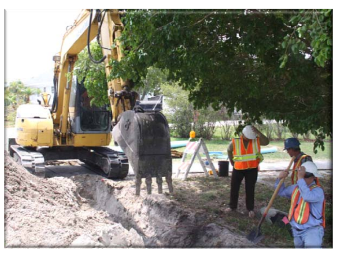
Dunes Pipe laying

The Dunes Mains Replacement Project got under way in mid-April, starting near the clubhouse and working west. Locating existing utilities took longer than expected. If a definite location of a particular utility cannot be established before digging, the utility must be "pot-holed" or hand dug and exposed for a positive ID. While work is progressing on Sandcastle Rd. a second crew is installing pipe on side streets. As of this printing, pipe laying is complete on Causey Court, Sanderling Circle, and on Sandcastle from the tennis courts to Sanderling Circle. You may also notice a "boring" machine, a funny looking tractor with a rack full of metal pipes