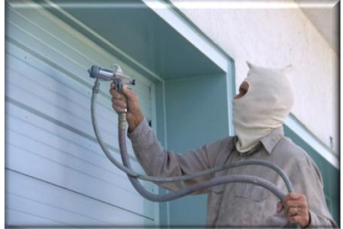
Spray-painting IWA garage doors

If you visit our Reverse Osmosis plant or the front office, you will notice the buildings and equipment look almost new. This doesn't happen automatically. The R.O. Plant is more than thirty years old and the office building was built seventeen