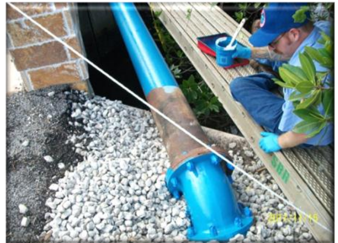
Aqueous pipe crossing maintenance/painting

years ago. We take our maintenance program seriously and are proud of the ongoing results. Employees in the Distribution, Maintenance, and Production Departments are qualified to use many types of tools. Our official Maintenance Department consists of four employees; however, employees in all three departments consider maintenance to be an important part of their job duties. We have such a broad depth of skills and expertise, our employees can fix just about anything.