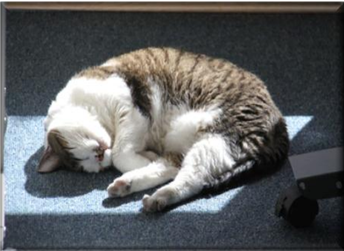
Lizzie catching some rays

Lizzie for her love of chasing lizards, and promptly adopted by everyone at IWA. Ever since then Lizzie has had a pampered home at IWA and has done pretty much whatever she wanted to do. Lizzie even has managed to appear in the IWA Pipeline Newsletter once or twice a year over the years.