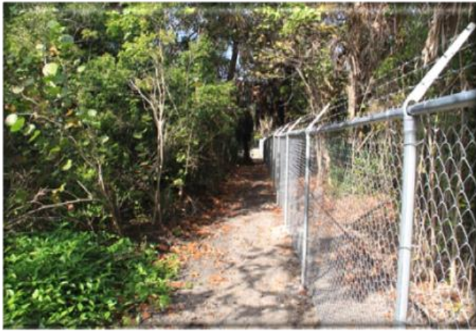
New fence line

IWA has a long list of subcontractors with whom we have long-term relationships. They understand the high quality of work that we demand, and we know we can expect that quality when we use them. We have started out 2012 with a flurry of projects such as roof repairs, garage door painting (contracted out), and grounds-keeping to take advantage of the nice, dry weather. At IWA, maintenance, repairs, and upgrades never stop.