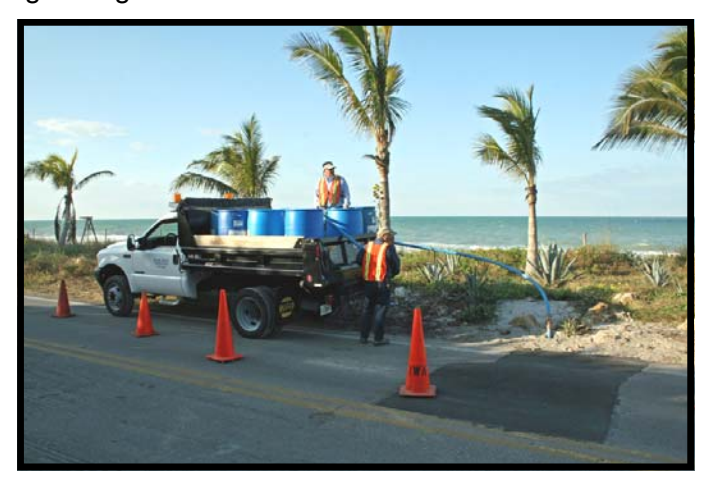
Manning the air vent during grouting

The Captiva main replacement project has been completed. The last part of the job was grouting the abandoned 12" ductile iron main.