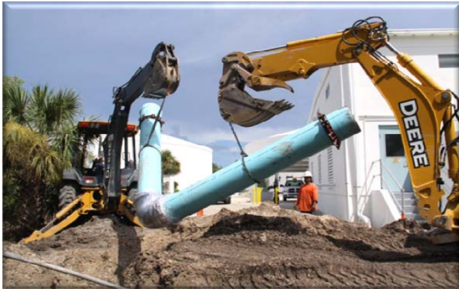
Replacing the first leg of transfer pipe—2009

at the same time. This year we will continue the 16-inch pipe from where we left off to the valves at the tanks. The aging valves at each tank will also be replaced as part of the project. Significant savings in energy costs were realized after 2009's pump replacements. This year's pipe replacement