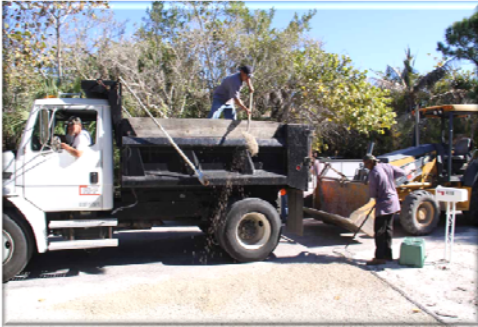
Driveway restoration in Sanibel Bayous

The residents of Sanibel Bayous must be thrilled to see the newly paved roads in their neighborhood. IWA completed the water mains replacement project this spring and completed all restoration prior to the repaving project. Service interruptions were minimal, and our crews even received a few compliments along the way.