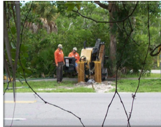
Boring under San-Cap Road

In 1997, IWA buried the first stretch of what would become 5 miles of Fiber Optic well control cable. The first run connected wells Hawthorne 5