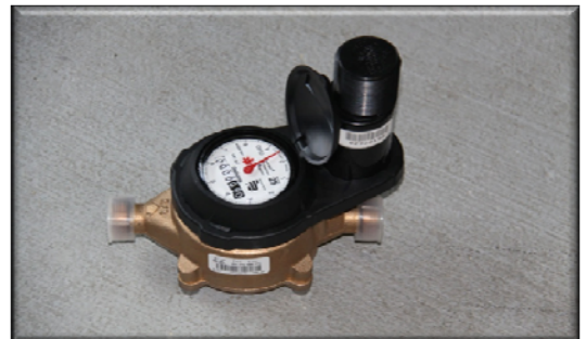
5/8" meter with AMR radio transmitter