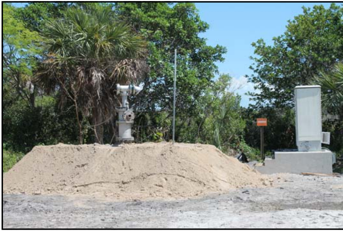
S9 Well Head

The well head is required to be above the 100-year flood stage, which is the reason for the mound of dirt around it. This well is located alongside the tram parking area for the JN Ding Darling National Wildlife Refuge, so IWA thanks US Fish and Wildlife for their patience, understanding, and helpfulness throughout the duration of this project.