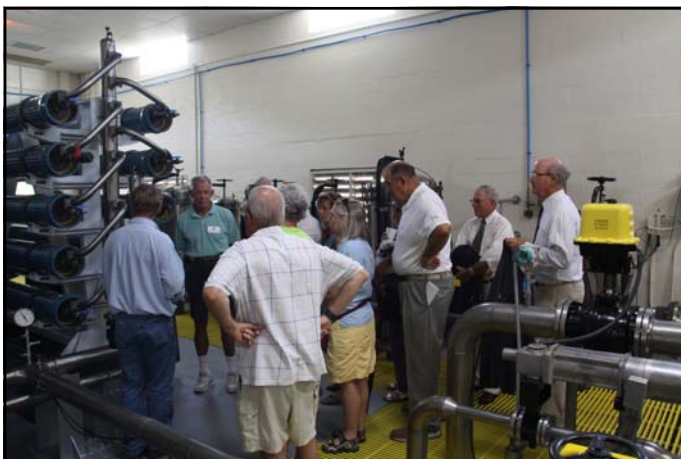
IWA Members Touring the RO Plant