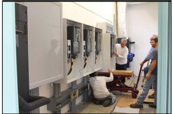
Electrical Work on New Distribution Pumping Station

The new building addition to the RO Plant for our upgraded distribution pumps is ready for the new pumps and motors, which are scheduled to be delivered in early July. Work on the piping for the new pumps is scheduled to begin by late May, and should be ready for the pumps when they arrive. The delay in delivery of the pumps and motors is a good indication of an improving economy, with companies that supply infrastructure projects struggling to fill backlogs of orders. Also, utilities are limited to a few manufacturers for these types of large pumps and motors. We hope to have the new station up and running before we are too far into the storm season.