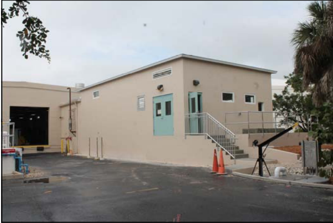
Southern View of Distribution Pump Station Addition

complete. Our thanks go out to Benchmark General Contractors for a job well done. The project came in on budget and on time.