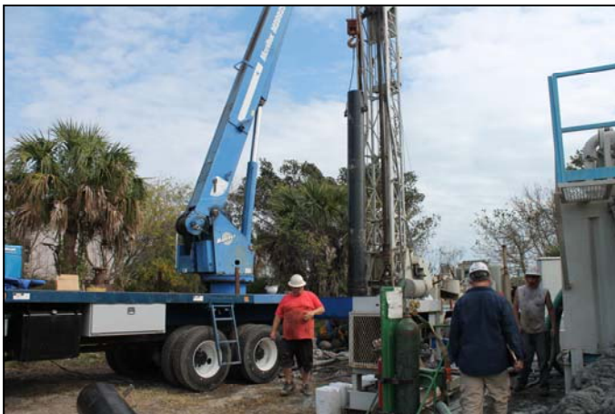
Setting the 18" Intermediate Steel Casing

More than six months later than expected, drilling finally began on IWA's newest production well, Suwannee 9, in early January 2015. A long