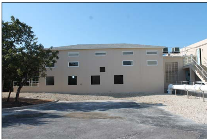
Northern View of Distribution Pump Station Addition

Phase one of the High Service Pumping Station Upgrade, the building that will house the up-graded pumps and motors that feed treated water from our storage tanks to our members, is now