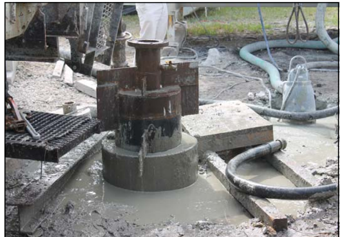
18" Intermediate Casing Grouted Inside the 26" Outer Casing

Next, a 30" hole was drilled to a depth of 50', and a 26" steel outer casing was set in the hole and grouted in. Then, a 24" hole was drilled inside this casing to a depth of 350', and an 18" intermediate steel casing was set in this hole and grouted in. This is where the project stands as this newsletter goes to print.