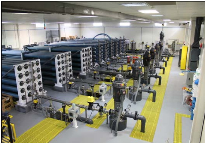
IWA Reverse Osmosis Plant

bay from St. James City to the end of Dixie Beach Rd. The pipe and all valving are still in place, but leaks in the pipe prevent its use. Our last gallon of usable water from Pine Island was obtained in 1983.