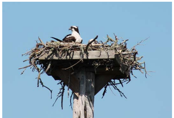
Mom and Dad on the nest

IWA's resident pair of ospreys came back like clockwork in late fall. They spent the next few weeks rebuilding their nest, and then settled in to start another family. In the most recent picture (lower), the female (behind the stick) seems to be sitting on some eggs. We will see in a few weeks. Not long after hatching it will be difficult to tell the young apart from its parents. Young ospreys weigh 80% of their adult weight at one month old. Osprey parents care for their fledglings for at least 90 days.