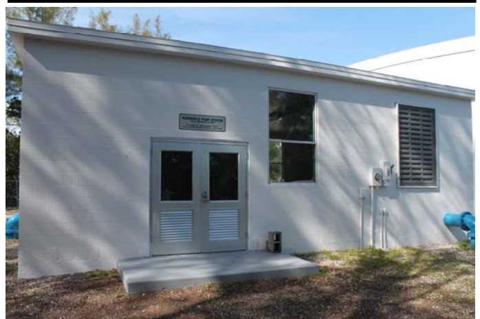
Freshly painted Periwinkle Pump Station

As with the two 5MG storage tanks at the RO Plant, our booster station storage tanks require regular maintenance and inspections. This past January the 2MG tank at the Periwinkle Booster Station, behind Roadside Park, was drained and inspected. The tank needed no repairs, but while the tank was empty a required safety rail was installed on the inside ladder. Tank level indicator pulleys and cables were inspected and replaced as necessary. This spring the tank will be pressure washed, sprayed down with bleach, and then painted. The painting will consist of a primer coat, then two coats of a long lasting coating containing a mildewcide. The mildewcide will prevent mildew, mold, and algae from growing on the outside walls of the tank. The paint should last for the next ten to fifteen years.