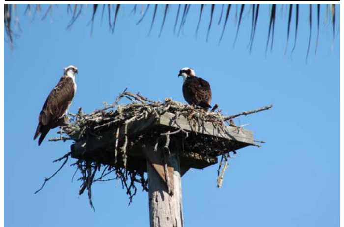
"It's your turn to get dinner!"

IWA's resident pair of ospreys came back like clockwork in late fall. They spent the next few weeks rebuilding their nest, and then settled in to start another family. In the most recent picture (lower), the female (behind the stick) seems to be sitting on some eggs. We will see in a few weeks. Not long after hatching it will be difficult to tell the young apart from its parents. Young ospreys weigh 80% of their adult weight at one month old. Osprey parents care for their fledglings for at least 90 days.