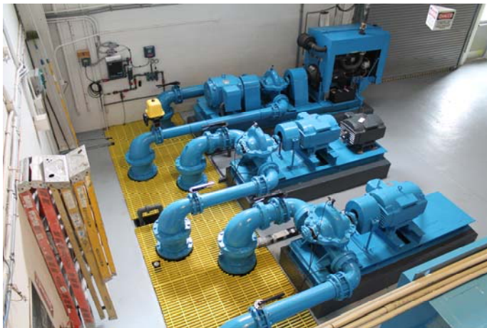
High Service Pumps inside the RO Plant

One major Capital project for 2013 involves evaluating our High Service pumping capability for ever increasing demand. IWA's High Service Pumping Station is located inside the RO Plant. It takes water from our on-site storage tanks (10MG) and pumps it into the distribution system at a constant pressure, on average about 70 psi. The station consists of three 100HP pumps driven by electric motors, and two 100HP pumps driven by propane fueled engines. One of the propane driven pumps is also connected to an electric motor (dual drive, against the wall in the picture), and is strictly for power outages. This pump comes up to full speed within a few seconds of a power outage, keeping pressure on our distribution system.