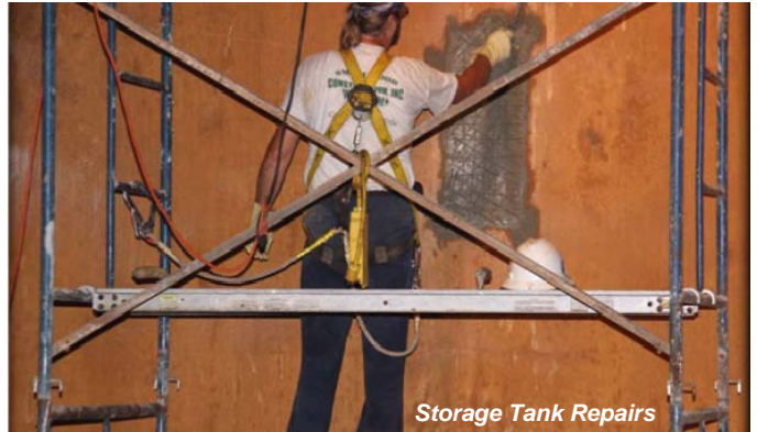
Storage Tank Repairs

An article in the Spring 2011 IWA Pipeline described how we perform periodic inspections of our storage tanks. The tank we inspected for that article is one of the 5MG tanks at the RO Plant. During this inspection a few patches of crumbled plaster were discovered on the interior wall. IWA contracted with Smallwood/Williams Construction, one of the original builders of our tanks, to repair the