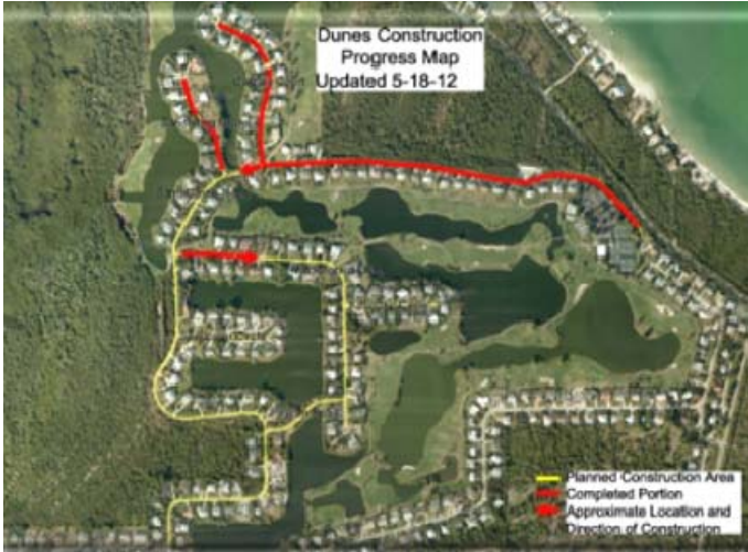
Map of construction progress in the Dunes

The Dunes Mains Replacement Project got under way in mid-April, starting near the clubhouse and working west. Locating existing utilities took longer than expected. If a definite location of a particular utility cannot be established before digging, the utility must be “pot-holed” or hand dug and exposed for a positive ID. While work is progressing on Sandcastle Rd. a second crew is installing pipe on side streets. As of this printing, pipe laying is complete on Causey Court, Sanderling Circle, and on Sandcastle from the tennis courts to Sanderling Circle. You may also notice a “boring” machine, a funny looking tractor with a rack full of metal pipes