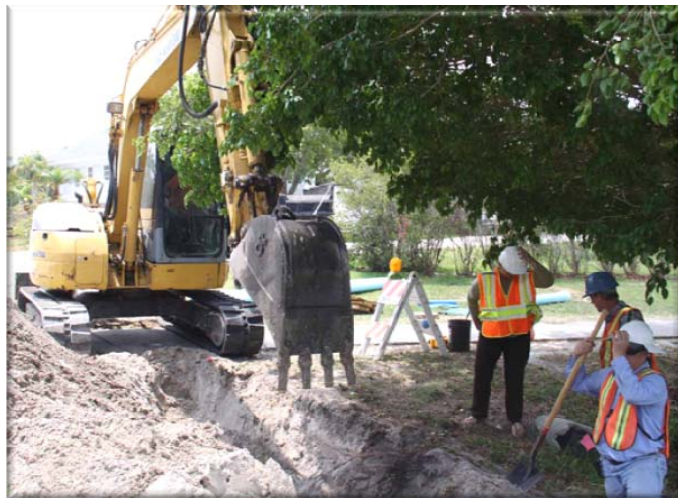
Dunes Pipe laying

The Dunes Mains Replacement Project got under way in mid-April, starting near the clubhouse and working west. Locating existing utilities took longer than expected. If a definite location of a particular utility cannot be established before digging, the utility must be “pot-holed” or hand dug and exposed for a positive ID. While work is progressing on Sandcastle Rd. a second crew is installing pipe on side streets. As of this printing, pipe laying is complete on Causey Court, Sanderling Circle, and on Sandcastle from the tennis courts to Sanderling Circle. You may also notice a “boring” machine, a funny looking tractor with a rack full of metal pipes